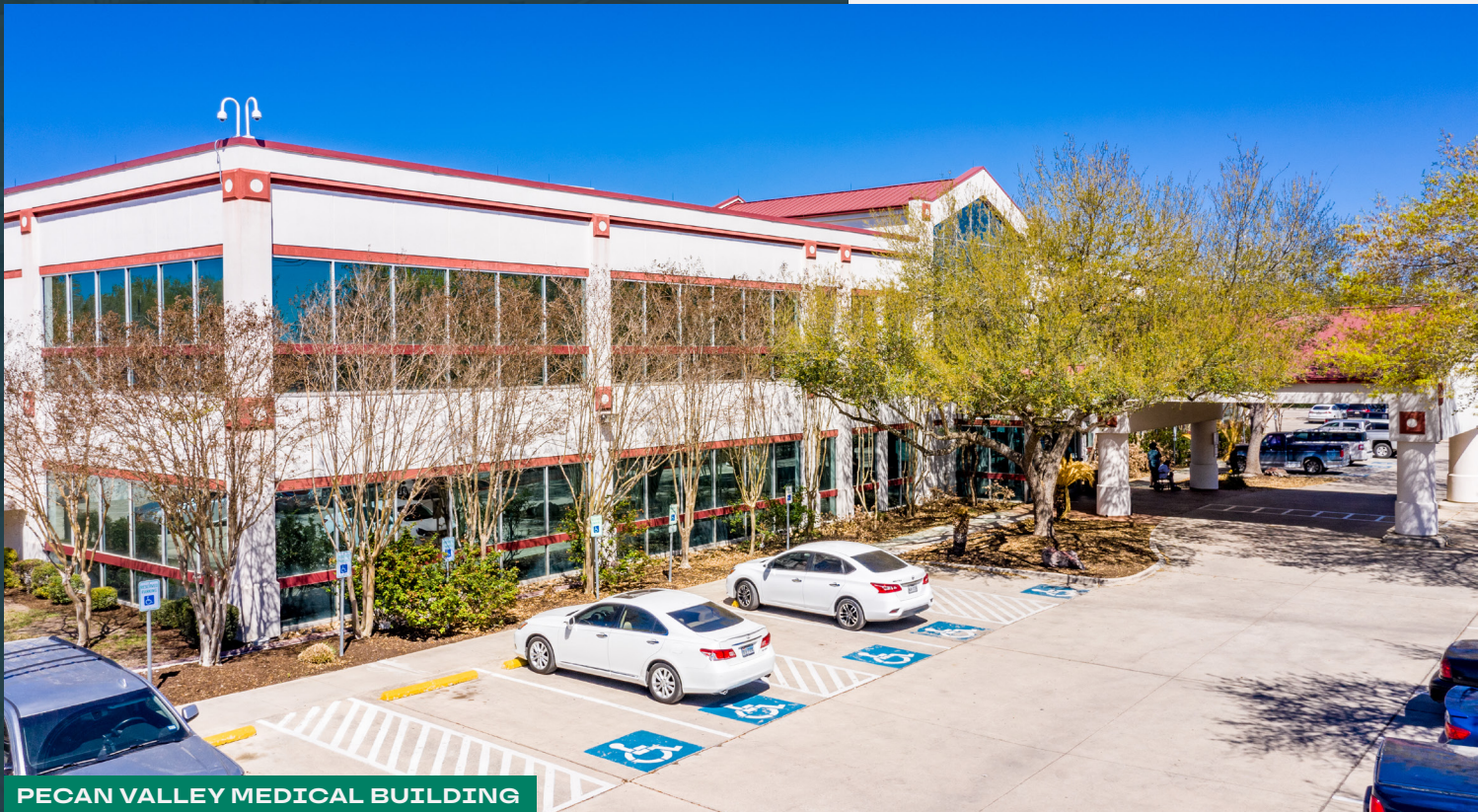
PECAN VALLEY MEDICAL BUILDING