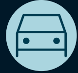
Underground & Visitor Parking