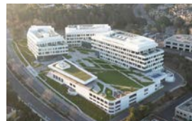
TORREY VIEW San Diego, CA