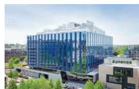
THE 105 Boston, MA