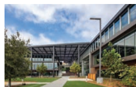
CALLAN RIDGE San Diego, CA