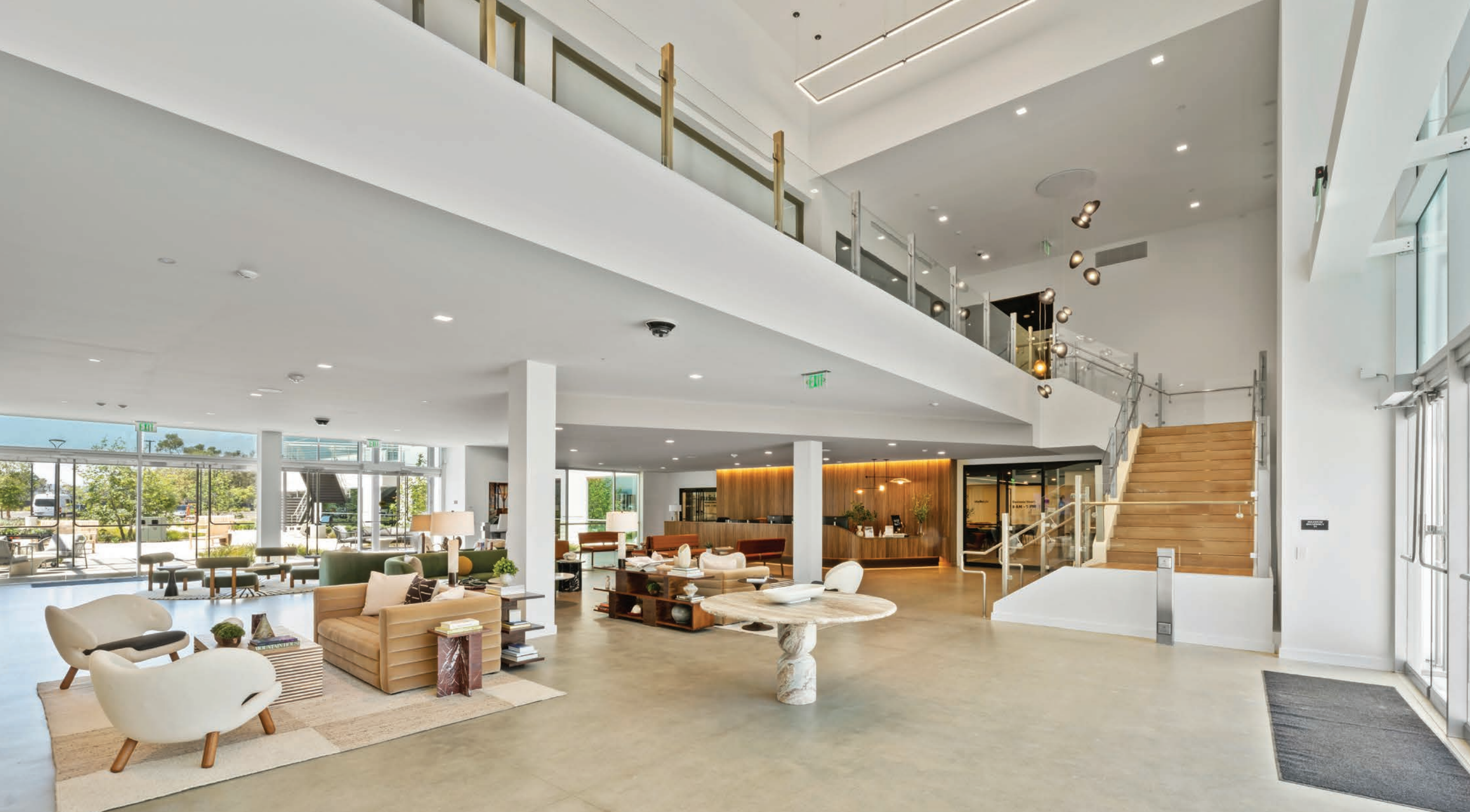
Lobby/Atrium and Lounge