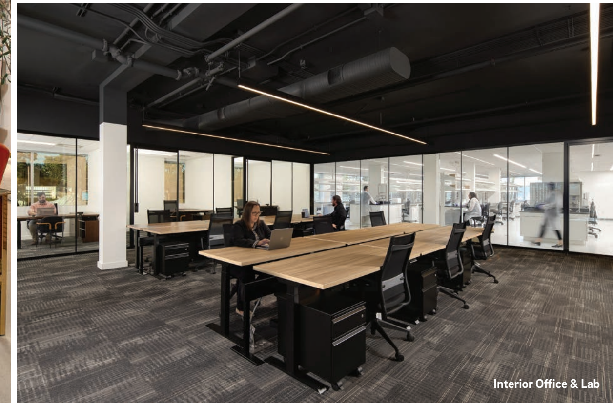
Interior Office & Lab