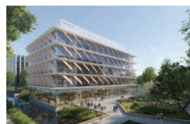
ONE HELIX Amsterdam, NL

FOR LEADING COMPANIES WITH DIVERSE RESEARCH NEEDS