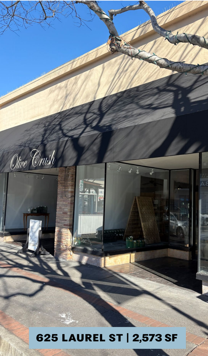
625 LAUREL ST | 2,573 SF