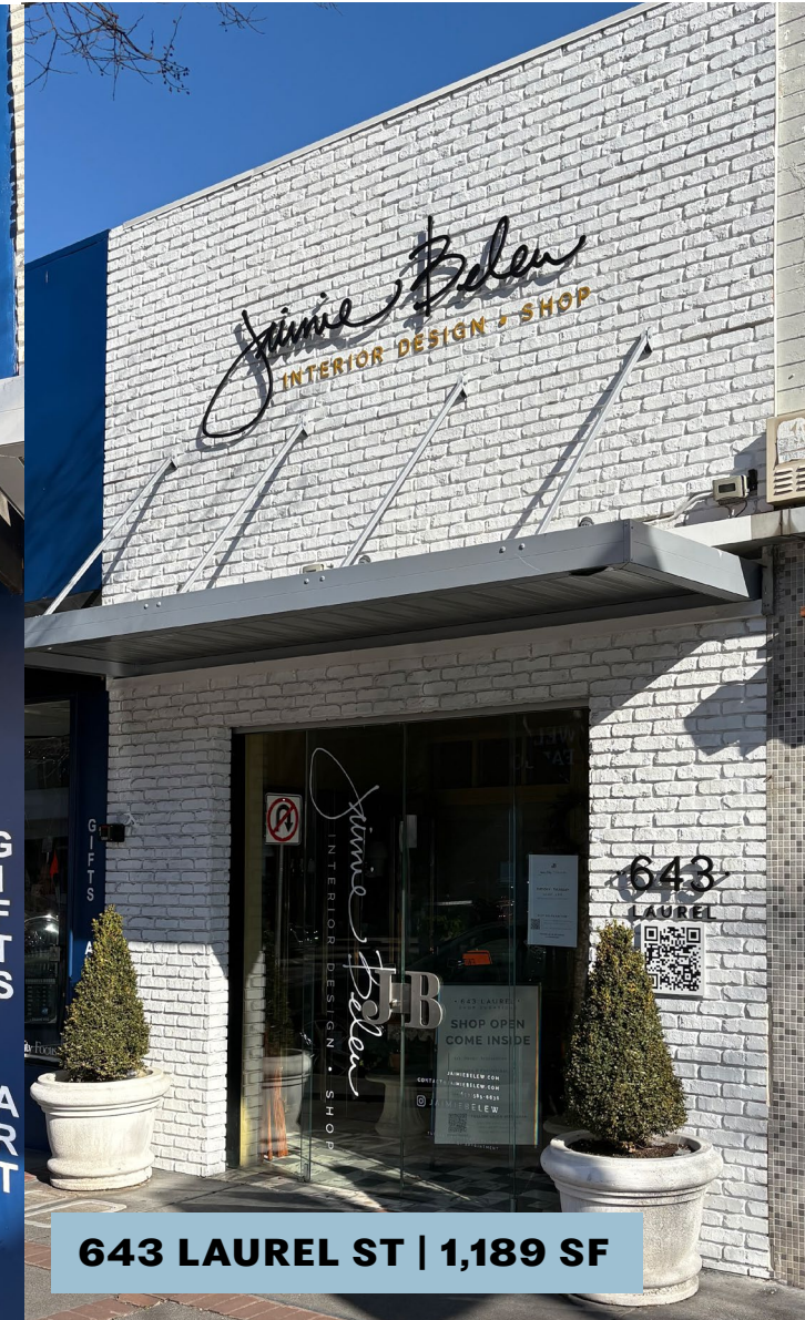
643 LAUREL ST | 1,189 SF