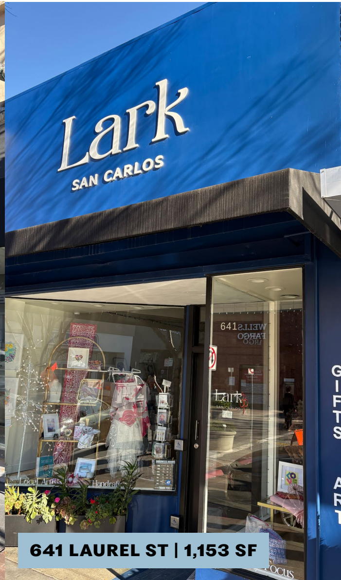
641 LAUREL ST | 1,153 SF