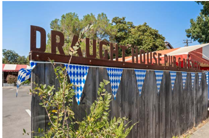
Draught House Pub & Brewery