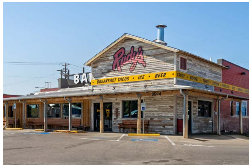
Rudy's "Country Store" and Bar-BQ