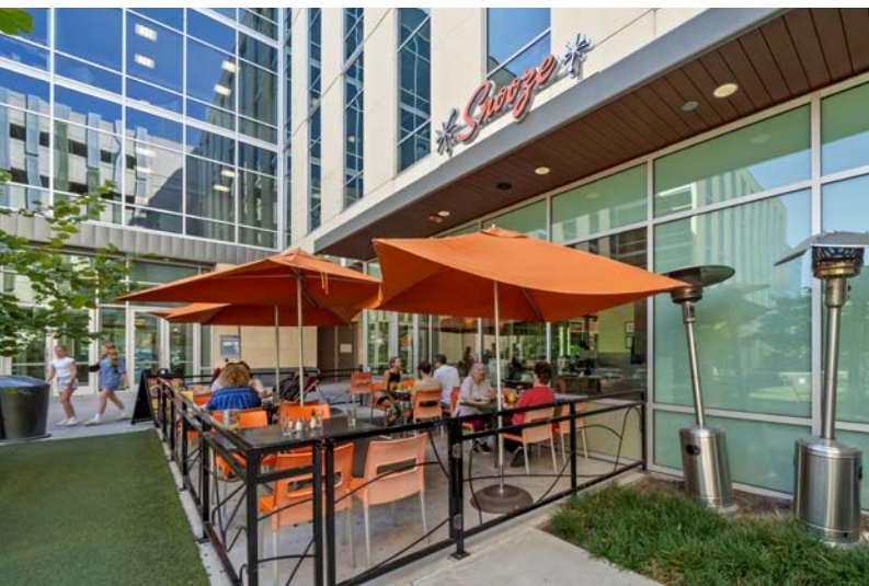
Snooze an AM Eatery