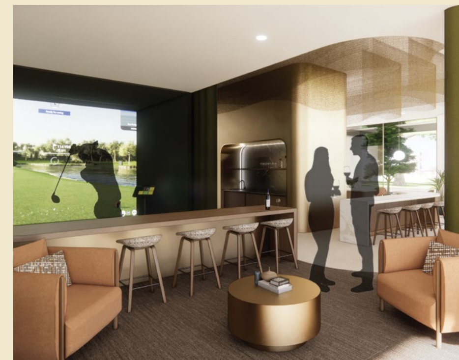
6:00 PM Evening reset @ the lounge