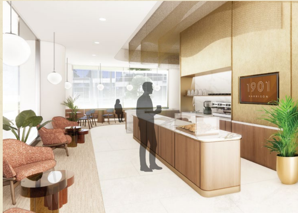
8:00 AM Sunrise starter @ the coffee bar