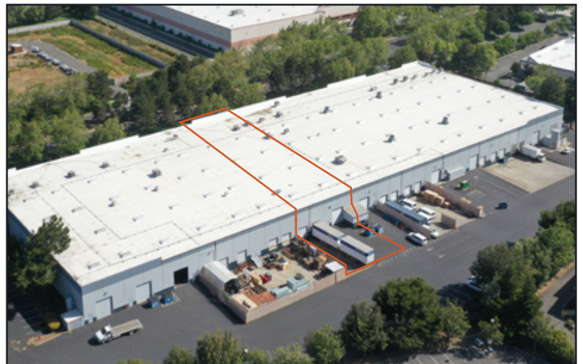
Suite C: 2 dock-high doors & 1 grade level door

To Schedule a Tour or For More Information, Please Contact: