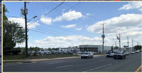
15421 Frederick Road