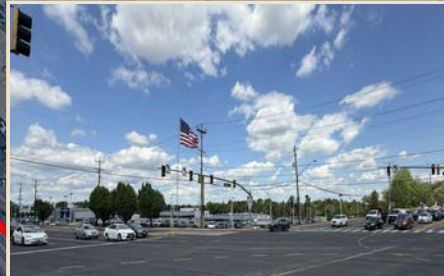
15301 Frederick Road