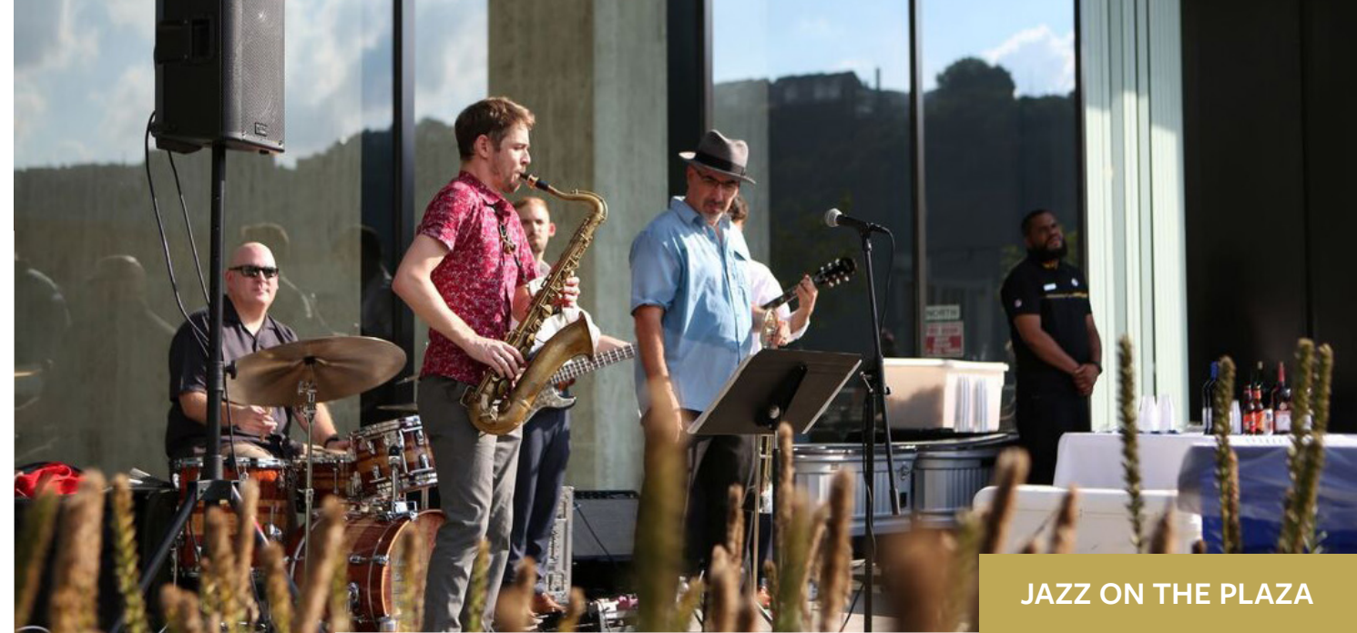
JAZZ ON THE PLAZA