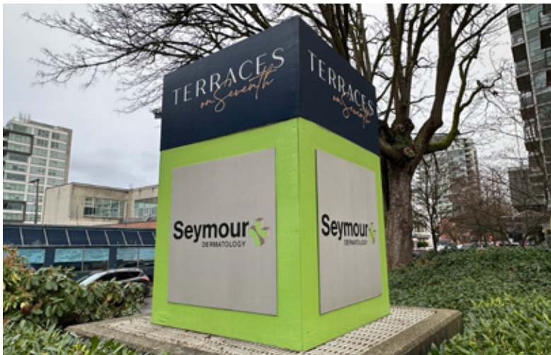
Pylon Sign Opportunity