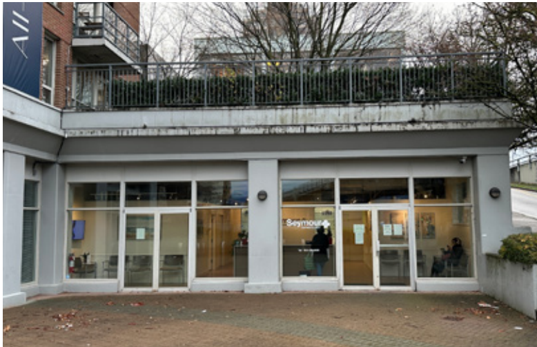
Corner of Fir Street and 7th Avenue