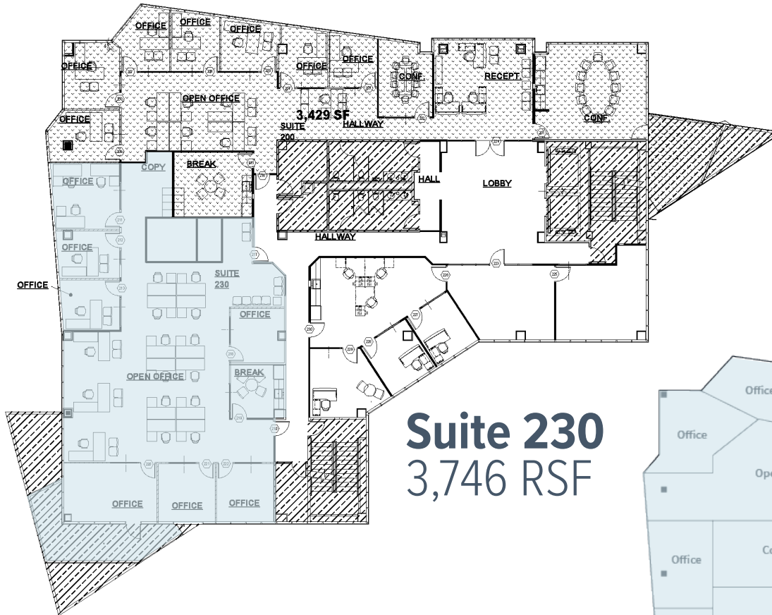
Suite 230 3,746 RSF