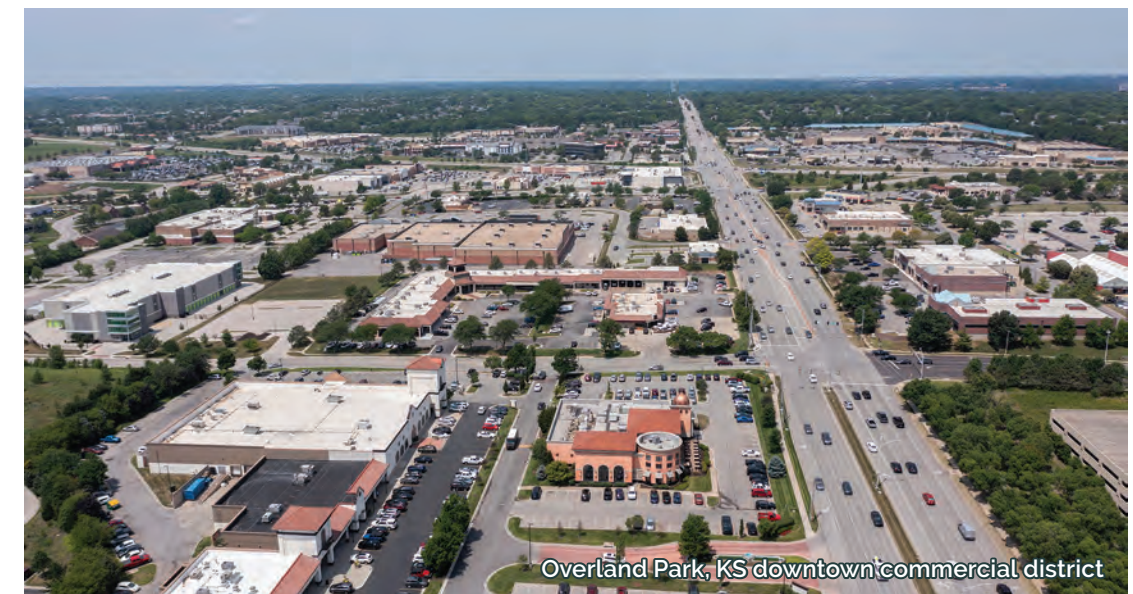
Overland Park, KS downtown commercial district