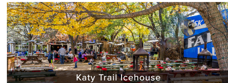
Katy Trail Icehouse