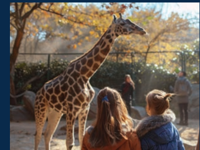
World Wildlife Zoo