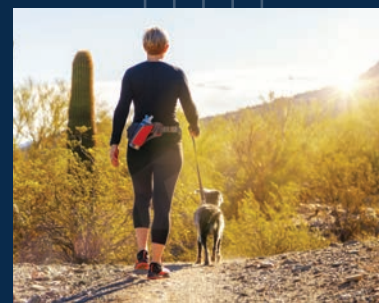
White Tank Mountains