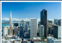
Downtown San Francisco