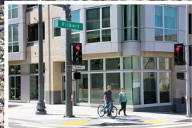
★ 1501 FILBERT ST