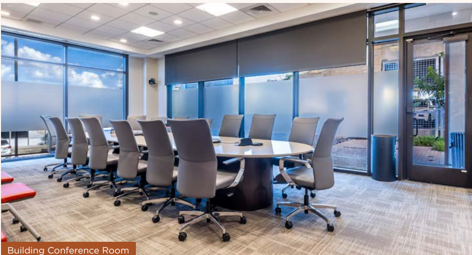
Building Conference Room