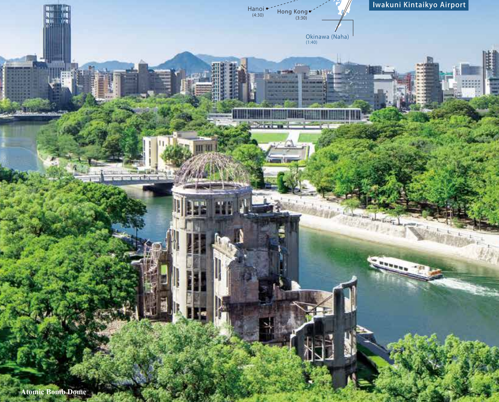
Atomic Bomb Dome