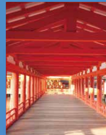
Cloister of Itsukushima Shrine

The brilliant contrast between the deep greenery of Mt. Misen at the back of the shrine and the vivid vermilion shrine building and giant torii gate standing on the blue sea is a beauty suggestive of the Palace of the Dragon King.