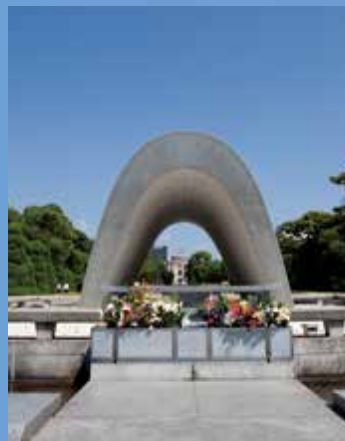
Cenotaph for the A-bomb Victims (Memorial Monument for Hiroshima, City of Peace) The cenotaph, which houses the Register of A-bomb victims, was designed in the shape of a clay figure of an ancient house in the hope of protecting the spirits of deceased victims from rain.

Dedicated to Sadako Sasaki, a young girl who suffered from and died of leukemia caused by the A-bombing, this monument was constructed to console the spirits of all child A-bomb victims.