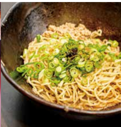
Tantanmen noodles without soup

Tsukemen, or dipping noodles, is a dish of ramen noodles and crispy vegetables that are dipped and eaten in separately served spicy broth.