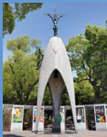
Children's Peace Monument

This museum collects and displays belongings left by A-bomb victims, as well as photos and other materials that convey the horror of the A-bombing, introduces the history of Hiroshima both before and after the event as well as the current situation of the Nuclear Age, and realistically conveys the true nature of the damage caused by the A-bombing.