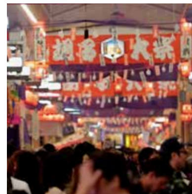
Ebisu Taisai Festival

Place: Sumiyoshicho , Hiroshima-city Date: Mid-July (a two-day event) Celebrate summer with chinowa, floating dolls, boat ceremony, kagura, and fireworks.