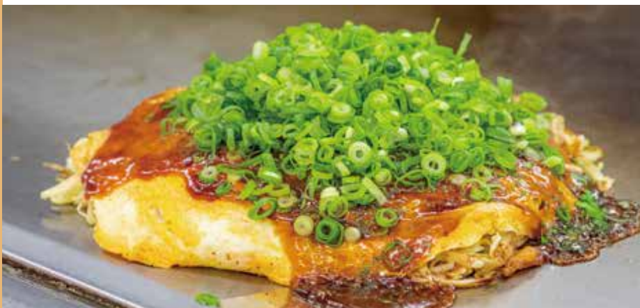
Hiroshima okonomiyaki (Hiroshima-style savory pancake)

An array of fish and shellfish will appear, having been raised in the calm sea unique to the Seto Inland Sea.