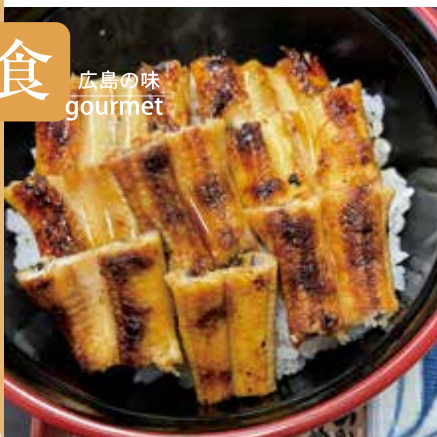
Anago meshi (conger eel served on rice)

Anago meshi is made by spreading pieces of moderately fatty conger eel from coastal waters prepared in kabayaki style (boned fish broiled with a sweet and salty sauce) on top of rice in a bowl.