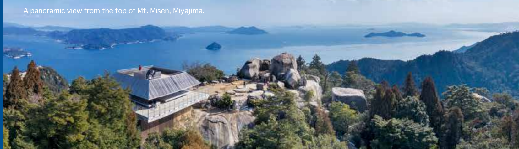
A panoramic view from the top of Mt. Misen, Miyajima.

Dive! Hiroshima The Official Guide to Hiroshima https://dive-hiroshima.com/en/