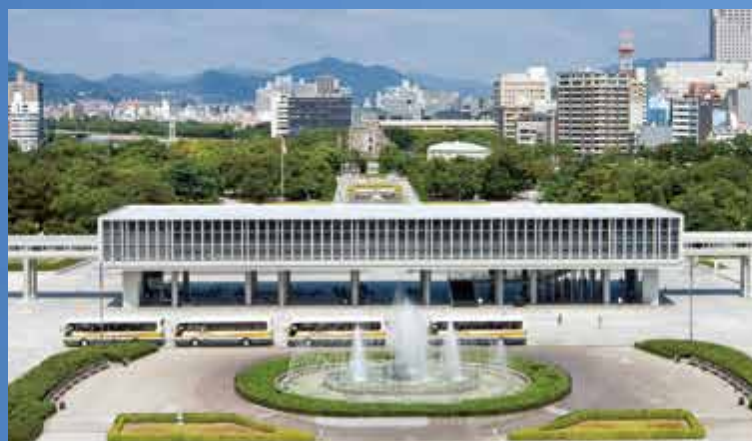
Hiroshima Peace Memorial Museum

Itsukushima Shrine shows a variety of expressions depending on the ebb and flow of the tide - an elegant appearance floating on the sea during high tide and the tideland that provides a walking path to the giant torii gate shown during the low tide.