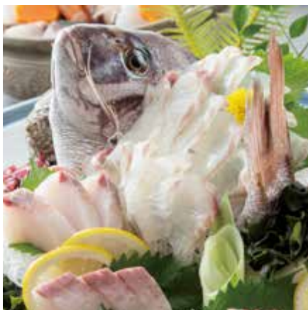
Fish dishes from the Seto Inland Sea

Anago meshi is made by spreading pieces of moderately fatty conger eel from coastal waters prepared in kabayaki style (boned fish broiled with a sweet and salty sauce) on top of rice in a bowl.