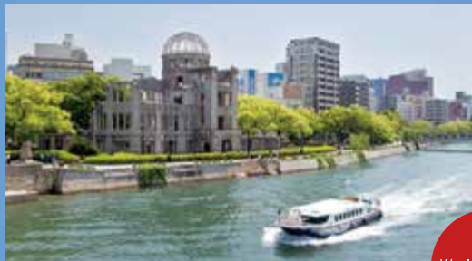
This route connects Peace Memorial Park and Miyajima. The attraction of this route is the chance to appreciate the beauty of many islands in the Seto Inland Sea during the cruise.

In 1996 the A-bomb Dome was registered on the UNESCO World Heritage List as an architecture that conveys the horrors of A-bombing.