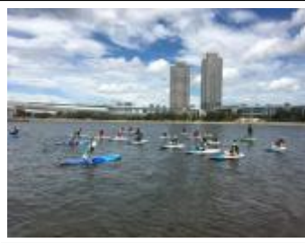
Odaiba SUP Yoga