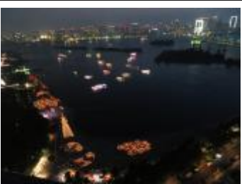
Sea Light Festival ②