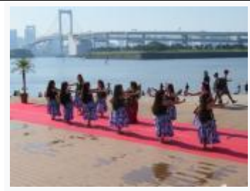
Sea Light Festival ①