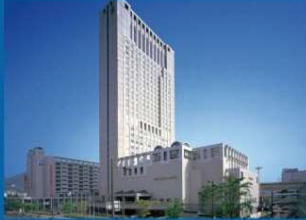
RIHGA Royal Hotel Kokura