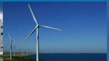
Environmental Learning Tours