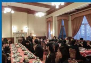
Former Moji Mitsui Club