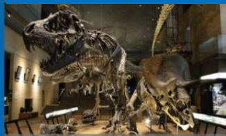
Kitakyushu Museum of Natural History & Human History