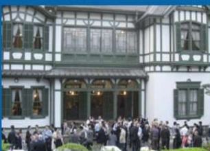
Industry Club of West Japan