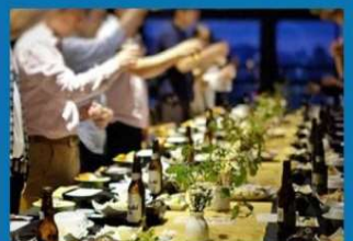
Reception at Kokura Castle