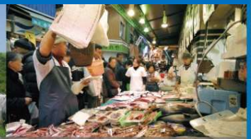
Tanga Market, the "Kitchen of Kitakyushu"