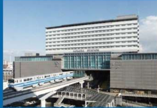
Station Hotel Kokura