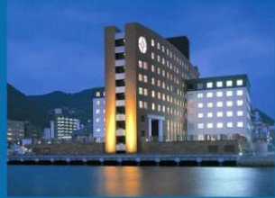
Premier Hotel Mojiko