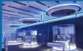
YASKAWA Innovation Center