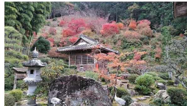
Tasshinji Zen Buddhist Temple