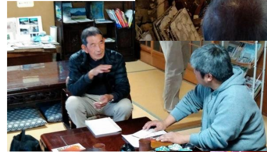
World's No.1 adzuki red beans Farmer