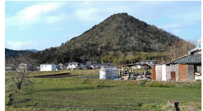
Tari Village (Image)