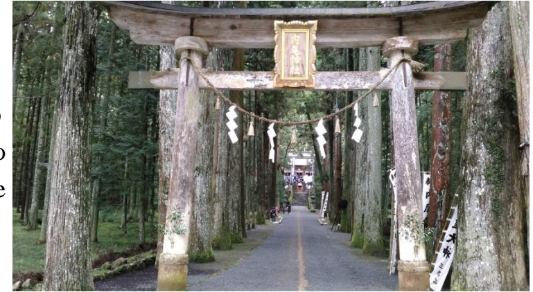
Uchio Shinto Shrine