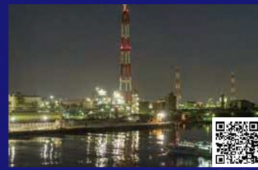
Regular night-view cruise services in Dokai Bay