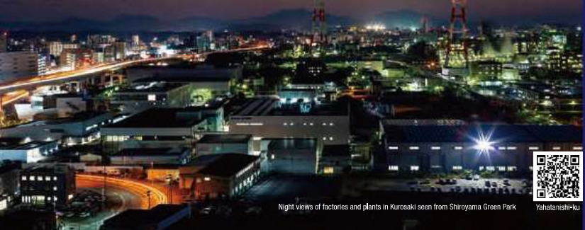
Night views of factories and plants in Kurosaki seen from Shiroyama Green Park

Kitakyushu also offers various ways to enjoy a factory night view, for example, from an observatory park, from across the sea or river, or from a boat.