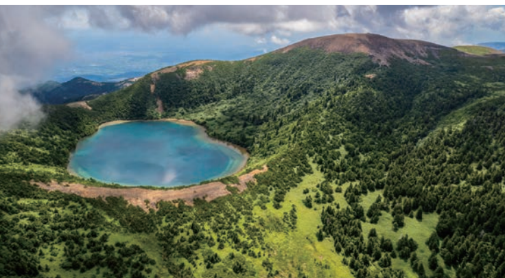
© Aditara - Azuma Nature Center