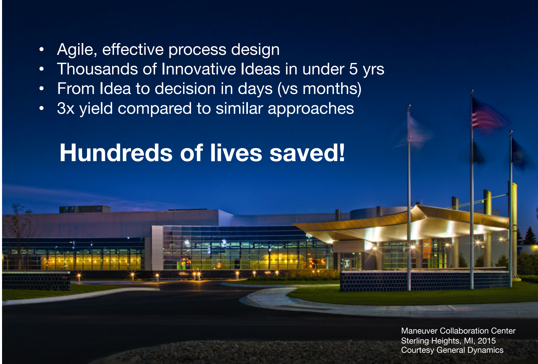
Maneuver Collaboration Center Sterling Heights, MI, 2015