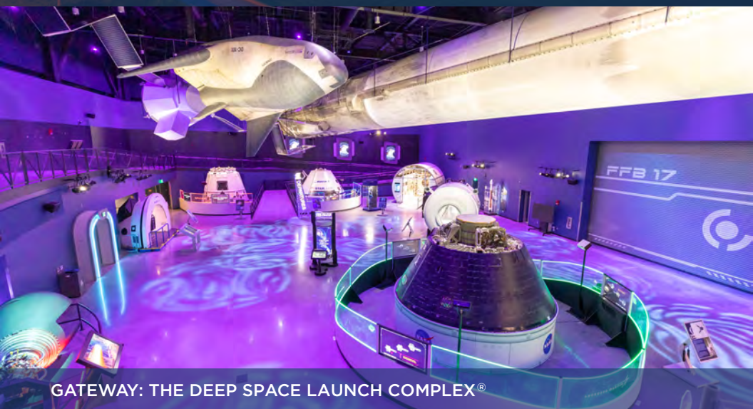
GATEWAY: THE DEEP SPACE LAUNCH COMPLEX®