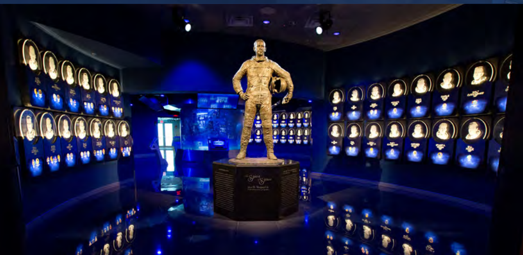
U.S. ASTRONAUT HALL OF FAME