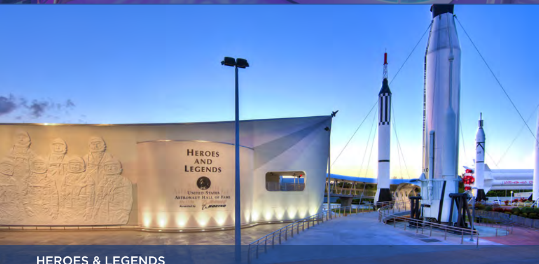
HEROES & LEGENDS