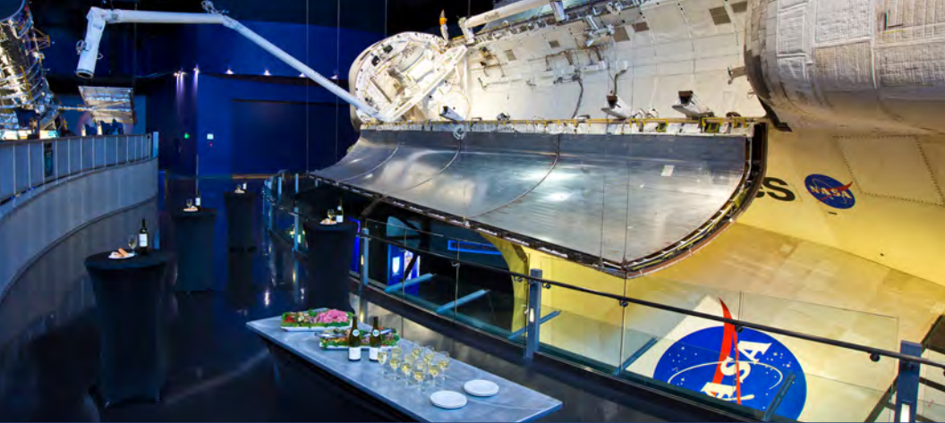
SPACE SHUTTLE ATLANTIS®