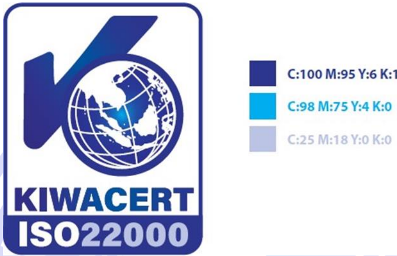
Figure 3: KIWACERT Certification Mark