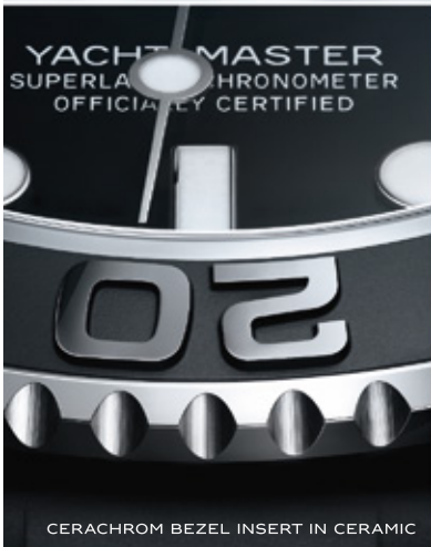
CERACHROM BEZEL INSERT IN CERAMIC