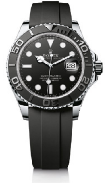
OYSTER PERPETUAL YACHT-MASTER 42 IN 18 CT WHITE GOLD