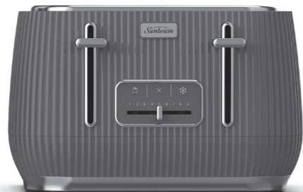
Radiance 4 Slice Toaster