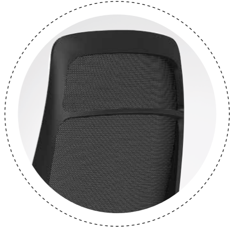
Flowing transitions: An elegantly curved bar is integrated harmoniously into the slim frame.