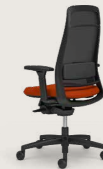
STRIKING TENSA.NEXT with an attractive backrest frame that extends beneath the seat.