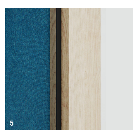
QUIET.BOX Organic Design variant with rounded corners.