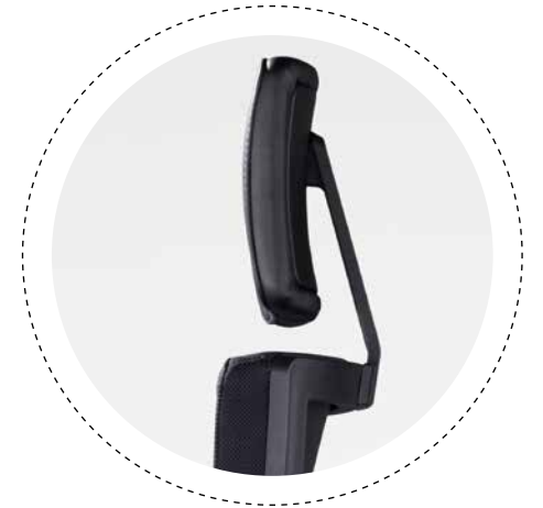
HEIGHT-ADJUSTABLE HEADREST To reduce strain on shoulder and neck muscles

OUR OKAY.II TASK CHAIR MEETS THE INDIVIDUAL REQUIREMENTS OF YOUR WORKING STYLE AND LAYS THE FOUNDATION FOR HEALTHY SITTING. THE ERGONOMIC CONTOURS OF THE BACKREST PROVIDE PERFECT SUPPORT, ESPECIALLY IN THE LUMBAR AREA. IN ADDITION, THE ALMOST INVISIBLE INTEGRAL ASYMMETRIC LUMBAR SUPPORT PROVIDES PRECISION CONTACT. EACH SIDE IS INDEPENDENTLY ADJUSTABLE IN HEIGHT AND CURVATURE, AND RELIEVES THE STRAIN ON THE SPINAL DISCS. THIS PRODUCES A COMFORTABLE SITTING SENSATION, AND YOU CAN REACH YOUR POTENTIAL EVERY DAY.