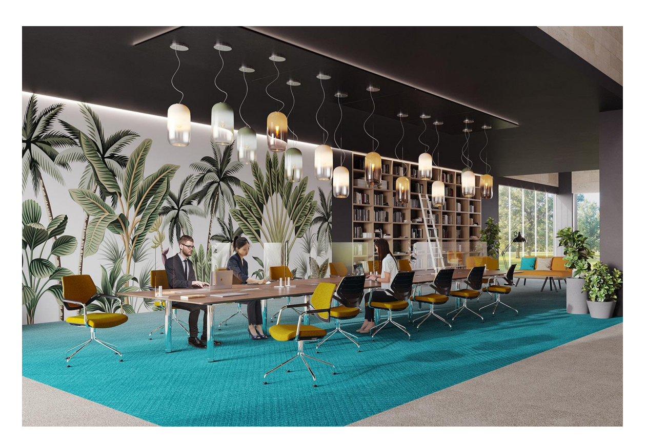
BU: K+N NOOK as a conference chair combines pleasant seating comfort and aesthetics.

tomorrow it can transform into a task chair with a homely feel, on a star base and castors – in a chosen shade or the corporate colour. Two completely different looks, yet with the same superior comfort. With K+N NOOK we're offering a characteristic design and a special sitting feel ... in a chair that's truly multi-facetted. We think this modular spectrum constitutes a key aspect of a future-proof product."