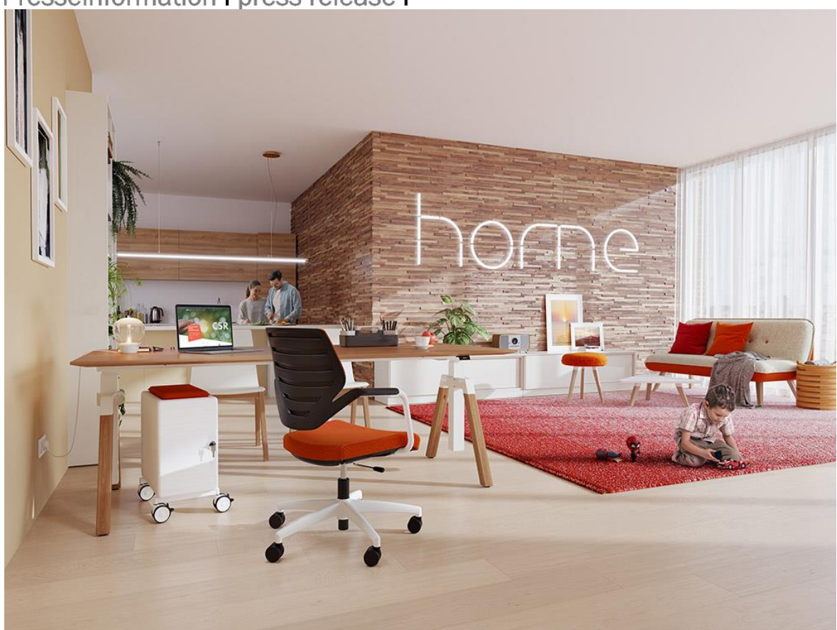
BU: In the home office, the K+N NOOK supports dynamic working