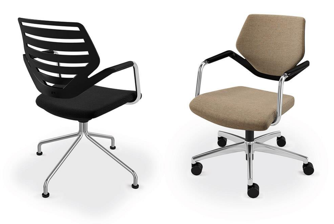
BU: The visitor and conference chair K+N NOOK convinces with its many possible combinations of different backrests and frame versions.