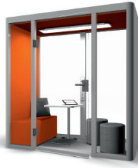
INTERNAL VARIANT 2 Mini-office for focused working