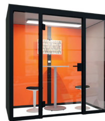
INTERNAL VARIANT 3 QUICK.IIIE and side table