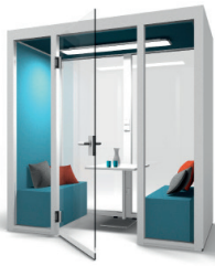
INTERNAL VARIANT 1 NET.WORK.PLACE bench and side table