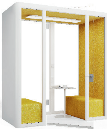
QUIET.BOX Duo Organic version with rounded corners