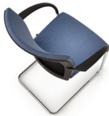
CANTILEVER MODEL Upholstered back