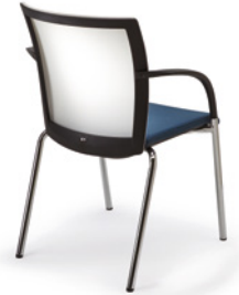
FOUR-LEGGED MODEL 3D mesh back