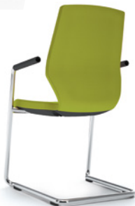
CANTILEVER MODEL With armrests