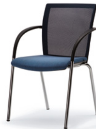
FOUR-LEGGED MODEL Mesh back