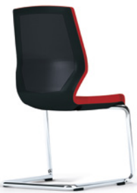
CANTILEVER MODEL Without armrests