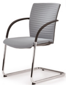
CANTILEVER MODEL Back in ribbed fabric