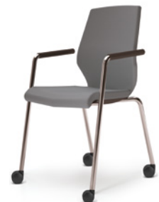
FOUR-LEGGED MODEL ON CASTORS Only with armrests