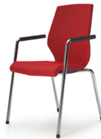
FOUR-LEGGED MODEL With armrests