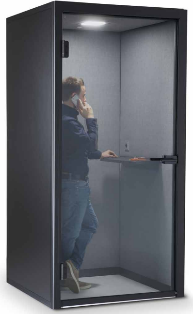
TALK.BOX design variant with rounded corners.