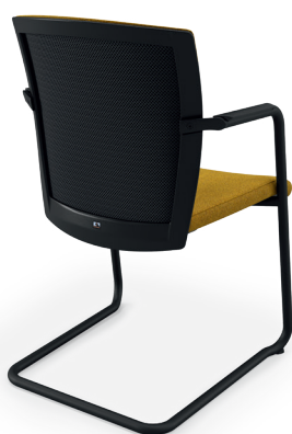
CANTILEVER MODEL incl. armrests, stackable