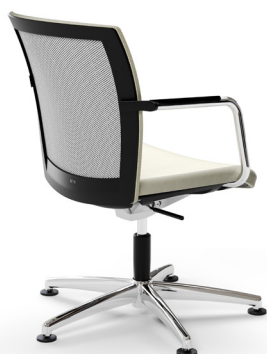
STARBASE flat or high, on glides or also with castors