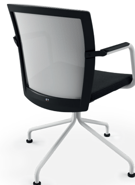
FOUR-LEGGED COLUMN BASE MODEL incl. armrests