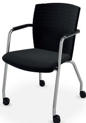
FOUR-LEGGED MODEL ON CASTORS incl. armrests, stackable