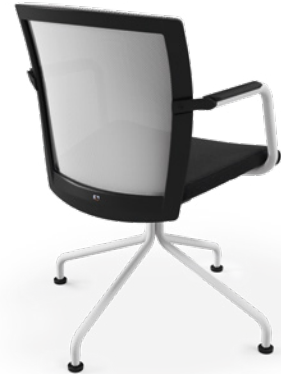
FOUR-LEGGED COLUMN BASE MODEL incl. armrests