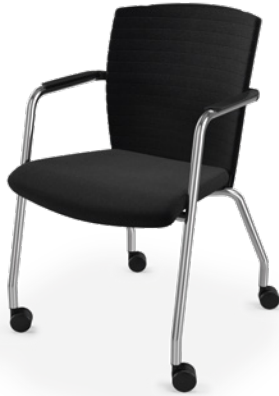
FOUR-LEGGED MODEL ON CASTORS incl. armrests, stackable