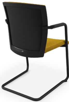
CANTILEVER MODEL incl. armrests, stackable