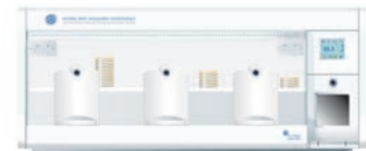
Order Code: A07500

An optional letterbox can be specified, ideal for quickly transferring all sizes of dishes and small items.