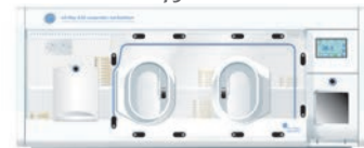
Order Code: A07520