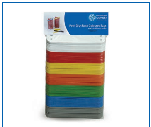
Petri Dish Rack Coloured Tags