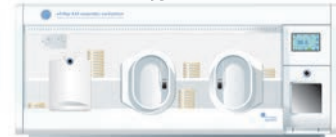
Order Code: A07530