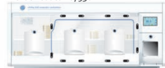
Order Code: A07510