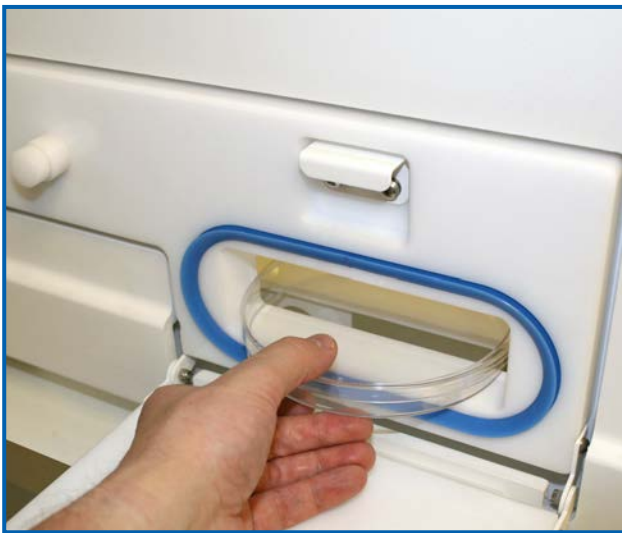
Optional Letterbox - Ideal for introducing individual samples quickly