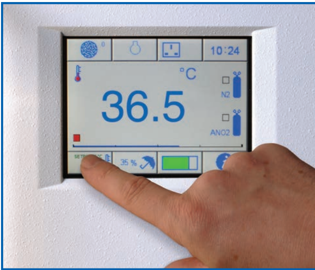
Intuitive operational software accessed via a full colour touch screen interface