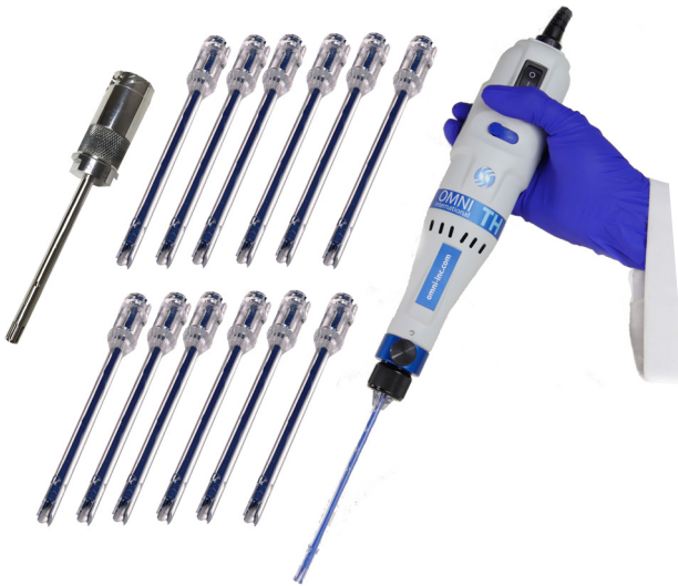
Omni Tip Kit with 7 mm Stainless Steel Generator Probe

Omni's convenient Tissue Homogenizing Kits come with everything needed to homogenize tissue samples quickly and efficiently for successful RNA extraction. Each kit includes an Omni TH Homogenizer with an adapter for mounting Omni Tips™ generator probes (see Omni Tip™ Plastic Probes Section for more information). A choice of stainless steel rotor-stator generator probes is also available (see Motor Maintenance Section for more information). Omni's Tissue Homogenizing Kits are designed for situations where molecular contamination between samples cannot be tolerated. Stainless steel generator probes are available for efficient processing of frozen and/or fibrous tissues. Omni Tips™ are ideal when molecular contamination is of the utmost concern and are most beneficial when working with soft, unfrozen tissues. It is important that the diameter and length of the selected generator probe will fit securely within the vessel being used and the generator probe (plastic or stainless steel) is appropriate for the application.