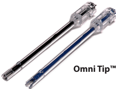
Omni Tip™ Plastic Probes