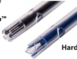
Hard Tissue Omni Tip™

NOTE: Omni Tip™ plastic probes are not factory presterilized or disinfected. If this is a requirement, please use one of the recommended methods described below.