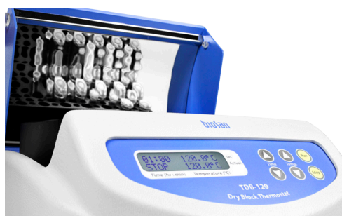
2 Block A-53

BS-010412-AAA BS-010401-QAA BS-010401-PAA