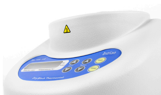
3 Block A-103