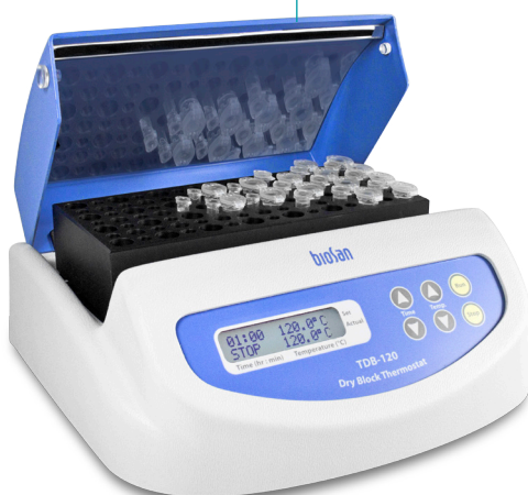
TDB-120 with block A-103