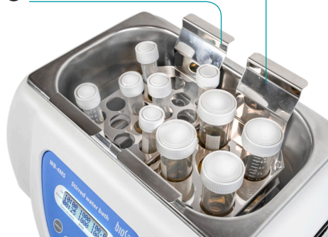
2 Rack QR-19