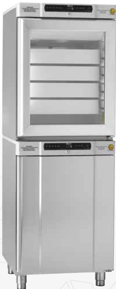
BioCompact II RR210 / RF210 Drawers and glass door are optional extras.

The BioCompact II 210 / 210 is a combination refrigerator and/or freezer cabinet with a small footprint, designed for a wide range of biostorage purposes where the prime focus is on dependability and exceptional performance.