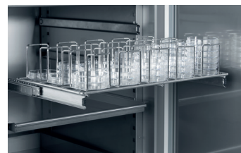
Rack for petri dishes