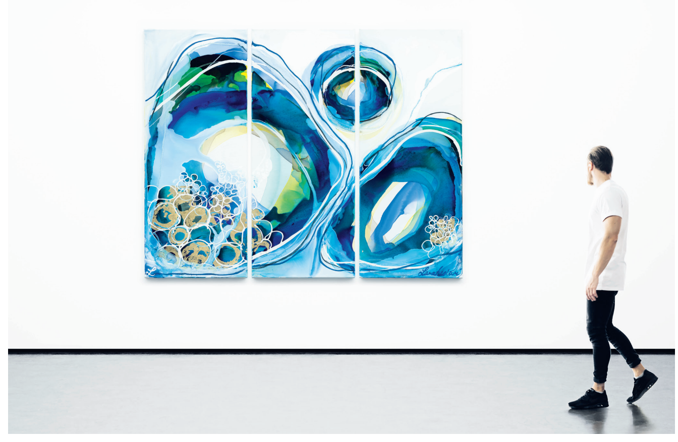
Salt & Sun I (triptych), Mixed Media on Canvas, each panel 51 x 122cm