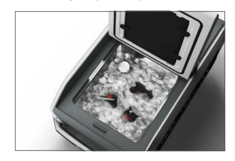
Capable of freezing to -22°C and keeping cooler contents chilled for up to 5 days