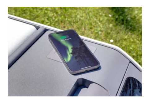
USB ports keep your devices fully charged when using the ePod battery while on the go