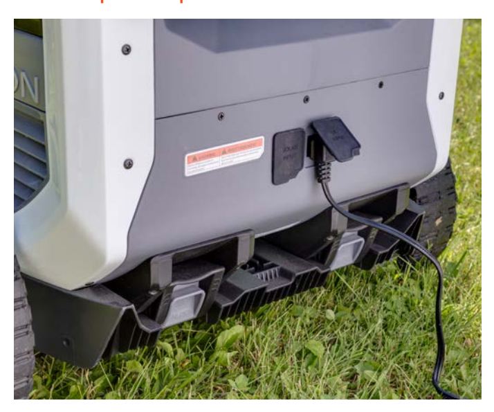
With flexible power options, you can easily plug in and charge the cooler with a 12V DC or 120V AC outlet. For longer trips, pair the cooler with an ePod battery and 100W folding solar panel