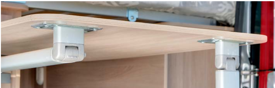
Fluted oval tube profile with folding design for compact storage