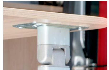
Die-cast aluminum hinge and top plate