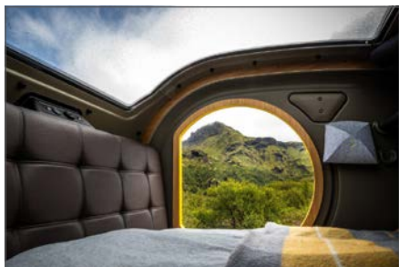
Countless possibilities for customization