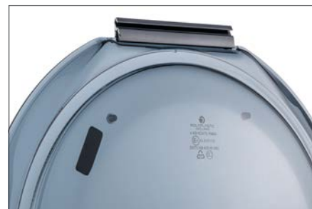
Custom shape example

With our custom designs and special requests, there are countless possibilities of window systems in diverse shapes, dimensions and installation locations. There are two customization categories available, Special or Exclusive Special. To request a custom window system requires following a sequence of steps that our sales department can assist with.