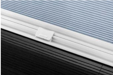
Integrated pleated-blind system