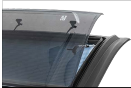
Manually operated panoramic roof window with a unique aerodynamic design