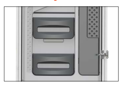
Built-in, double-thermoformed inner pockets for added storage