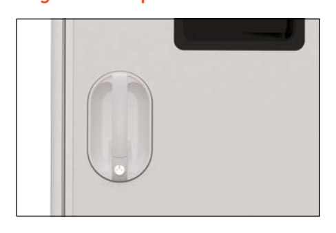
Premium, total white entry handle for comfortable, ergonomic operation