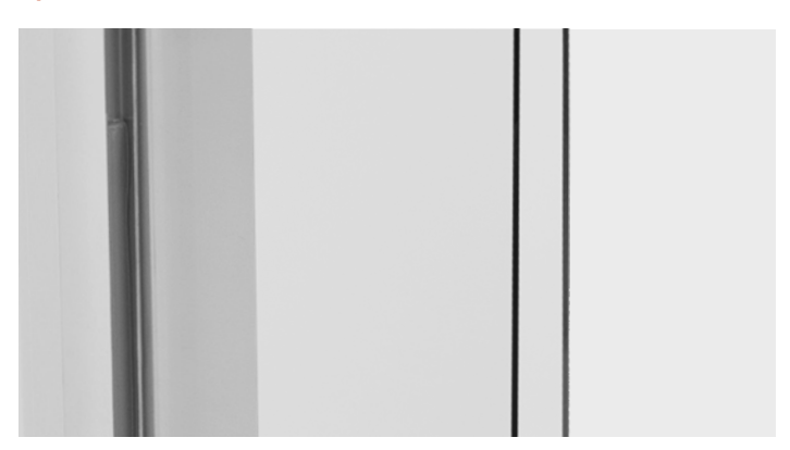
3/4" insulated glass with stainless steel spacer provides excellent energy performance; argon glass option available to further improve energy efficiency.