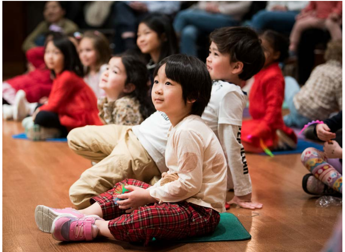
Children sitting on carpet squares