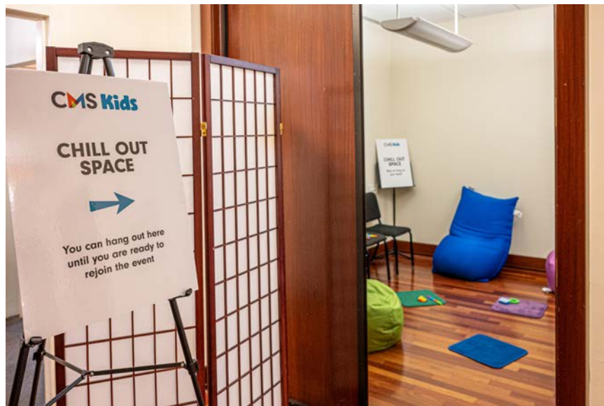
Signage designating the entrance to the chill out space

Inside the chill out space, I can sit on a bean bag, play with some fidgets, walk around, and express myself however I like. I can stay here as long as I need.