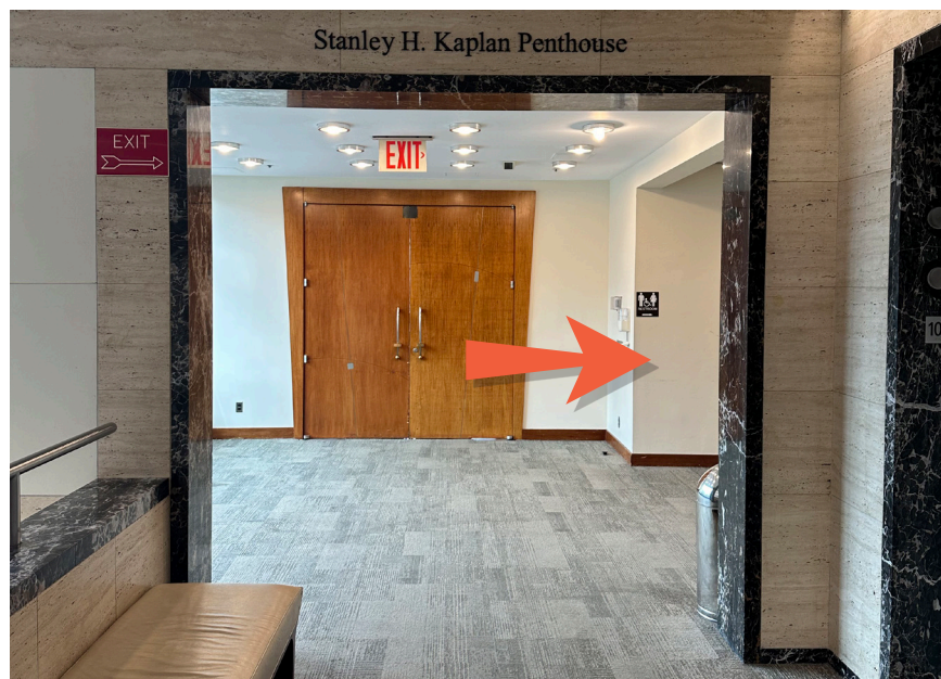
An arrow points to a hallway

The restrooms are labeled “Men” and “Women”; however, I am welcome to use the restroom that most closely aligns with my gender identity or gender expression.