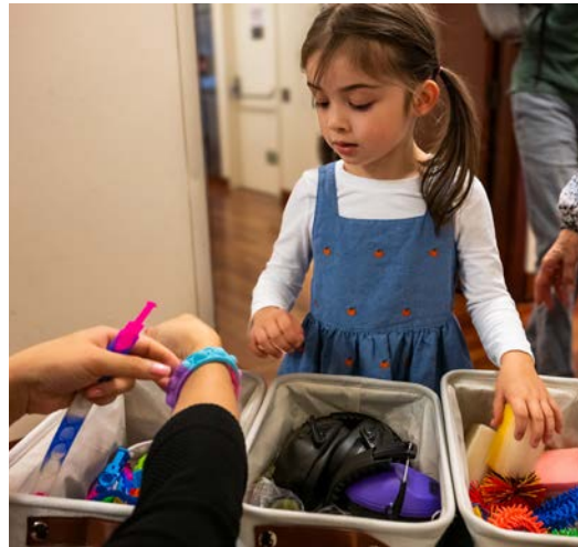
A child borrowing fidgets

I will be greeted by someone who will let me borrow any sensory materials I may need. I may borrow headphones, earplugs, and fidgets.