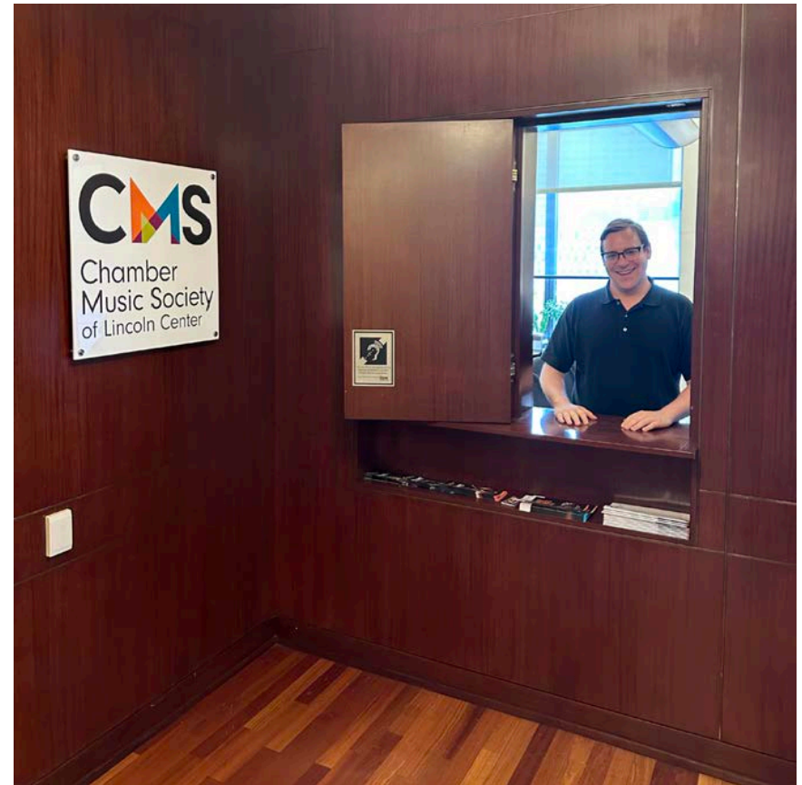
A man behind a ticket window

Once it is my turn, I will give the Box Office attendant my name and the concert I am attending. The Box Office attendant will give me my ticket and remind me that everyone I brought with me to this concert will need to have a ticket as well.