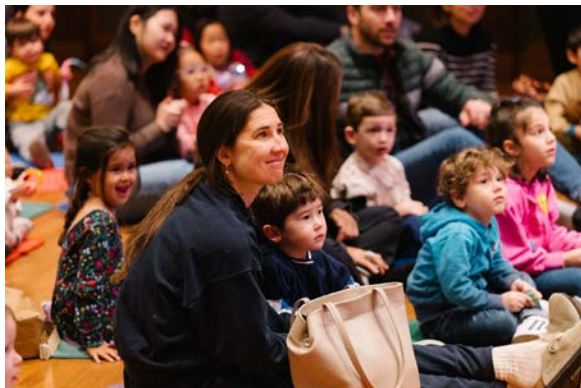
Families sitting on carpet squares

The carpet squares aren't only for kids. Any adults that came with me can sit with me on a carpet square or on a chair close by.