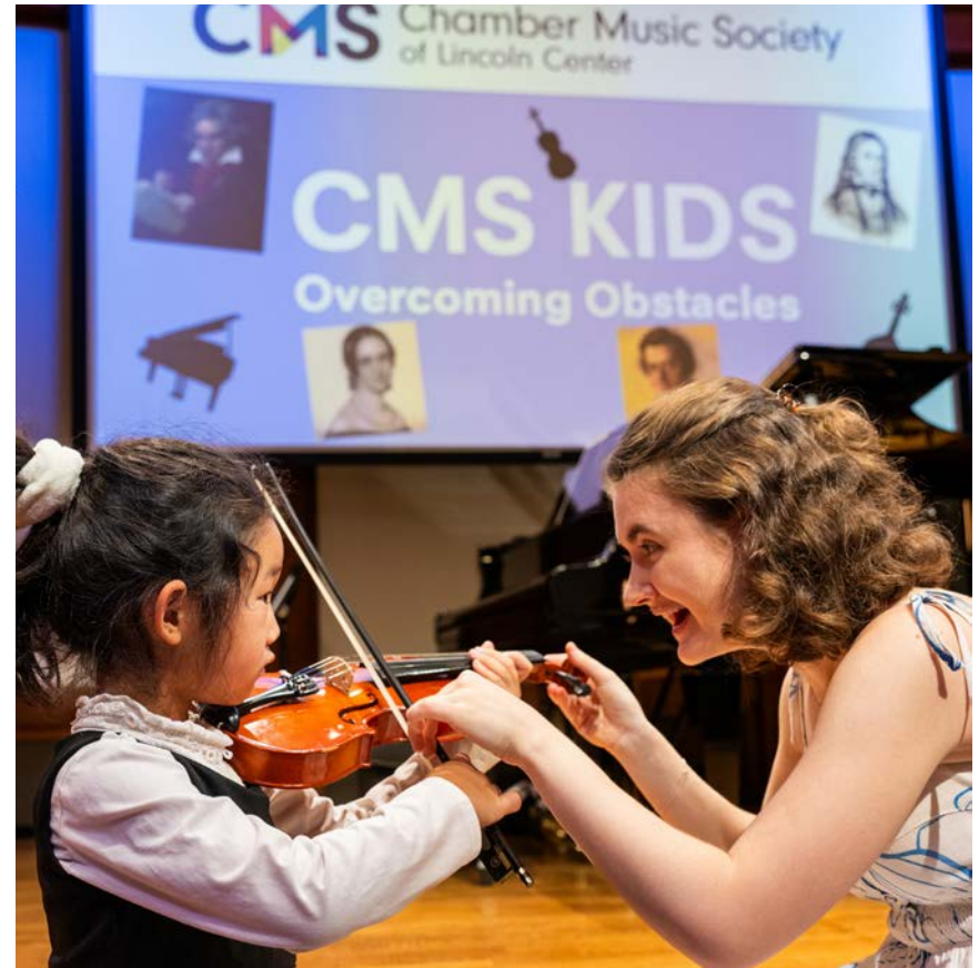
A musician teaches a child how to hold a violin

I may also have a chance to try out some of the instruments I saw on stage at the Instrument Petting Zoo near the front of the stage.