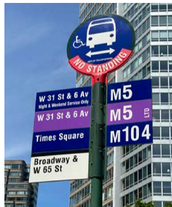
A bus sign

There are a few buses I may take to the Rose Studio. The M5, M7, M10, M11, M66 and M104 all stop within one block of the Rose Studio. I may need to transfer from another bus before getting on one of these.