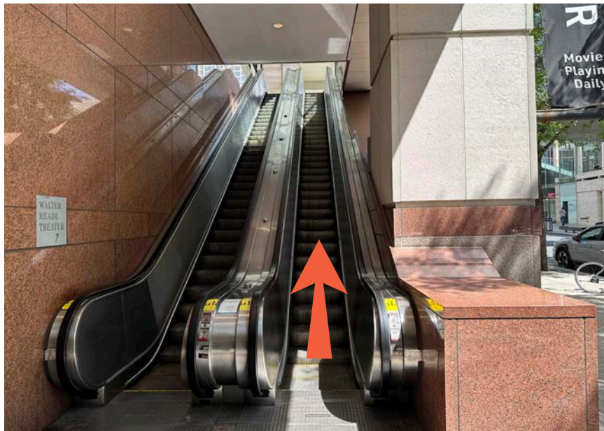
An arrow points up an ascending escalator

Once I'm upstairs, I'll go inside the front doors.