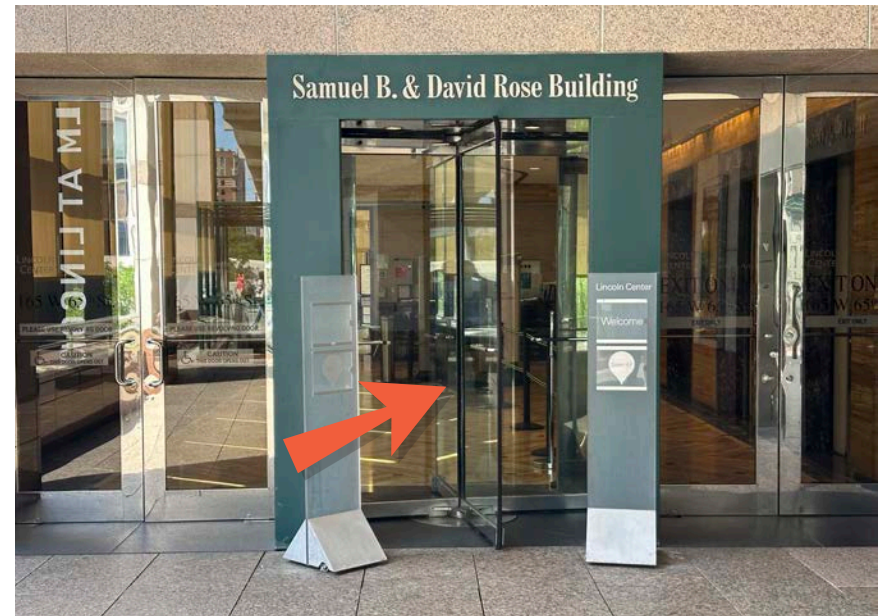
An arrow points through revolving doors