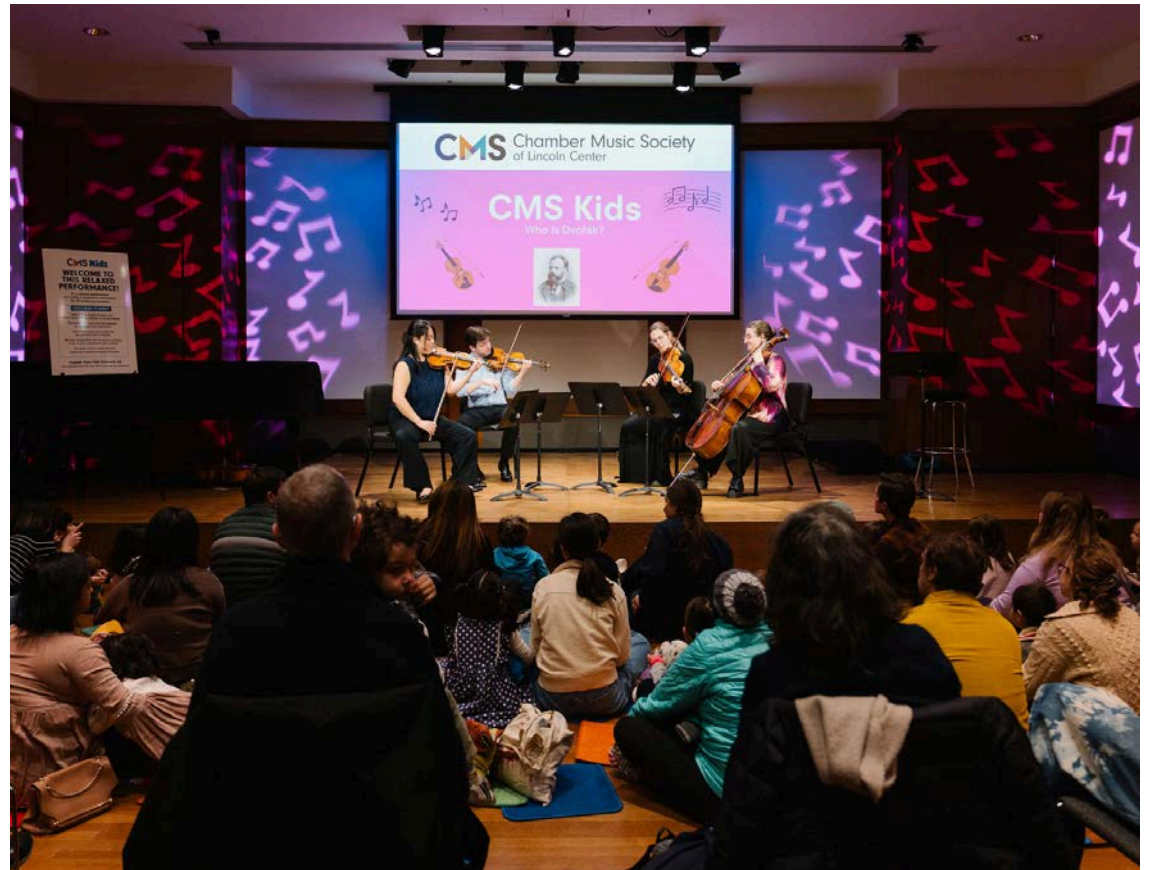
Musicians on stage

During the concert, I can expect to hear performers talking, see pictures on a projector, and, of course, hear lots of music. There may even be a fun activity for me to participate in. While all this is happening, I am welcome to experience the concert however is best for me: by clapping, talking, dancing, or using my sensory materials.