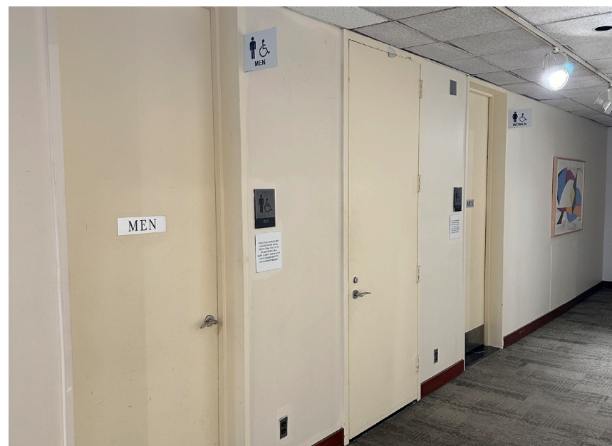
Bathroom door signs