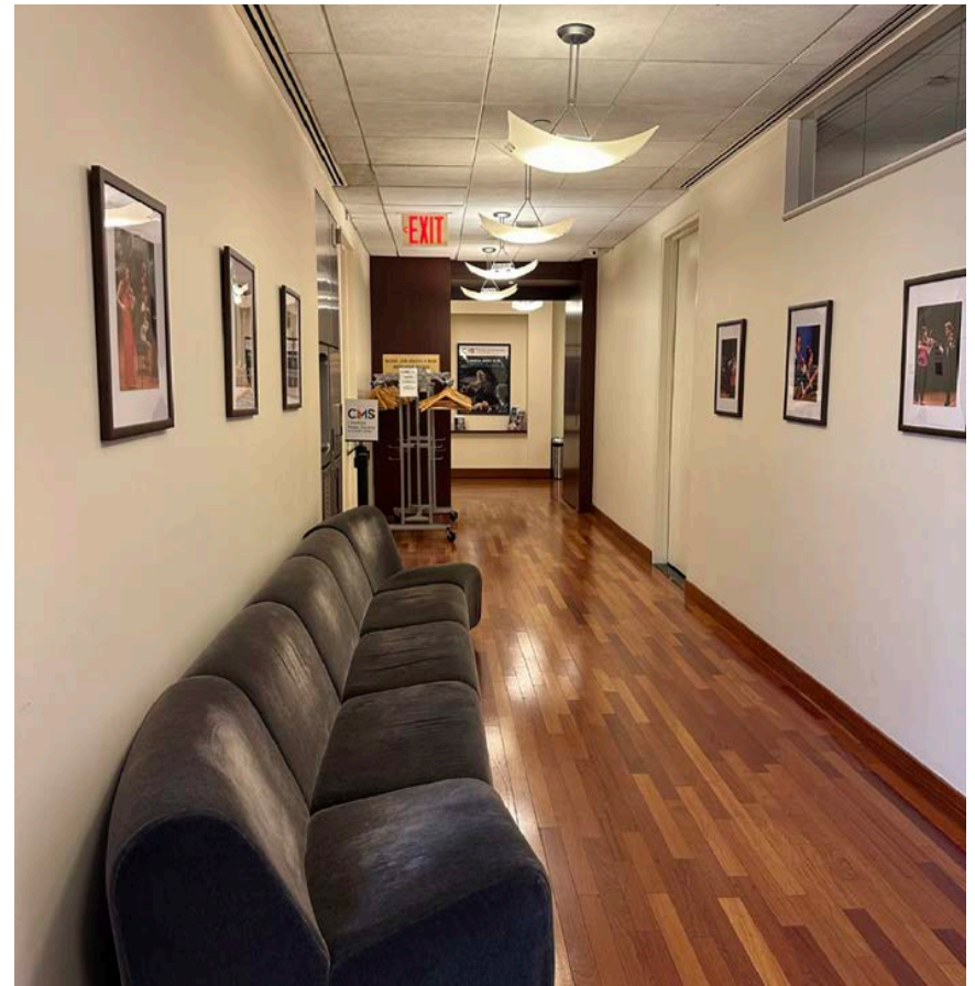
A hallway with a couch

As I walk into the Rose Studio, I will be able to pick up a program. This program has information about the concert such as the pieces being performed and the performers I will see on stage. If I don't want a program, I don't have to pick one up.