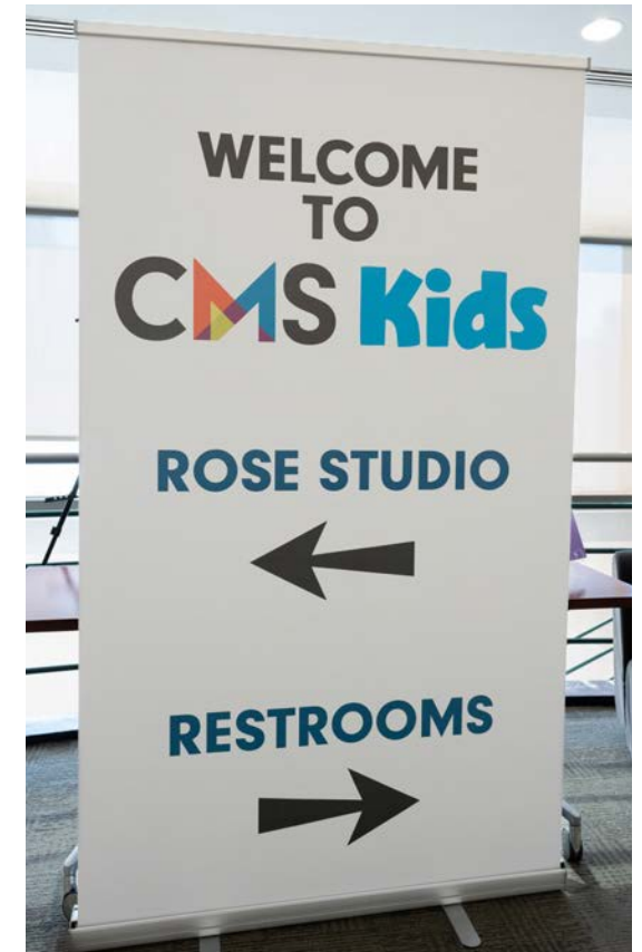
Signage directing audience members to the Rose Studio and to restrooms

I will also notice a sign that shows me that the Rose Studio is to the left of the elevators, and there are restrooms that I may use to the right of the elevators.