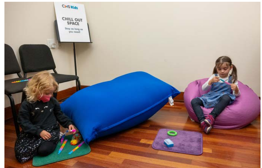
Children playing with fidgets in the chill out space